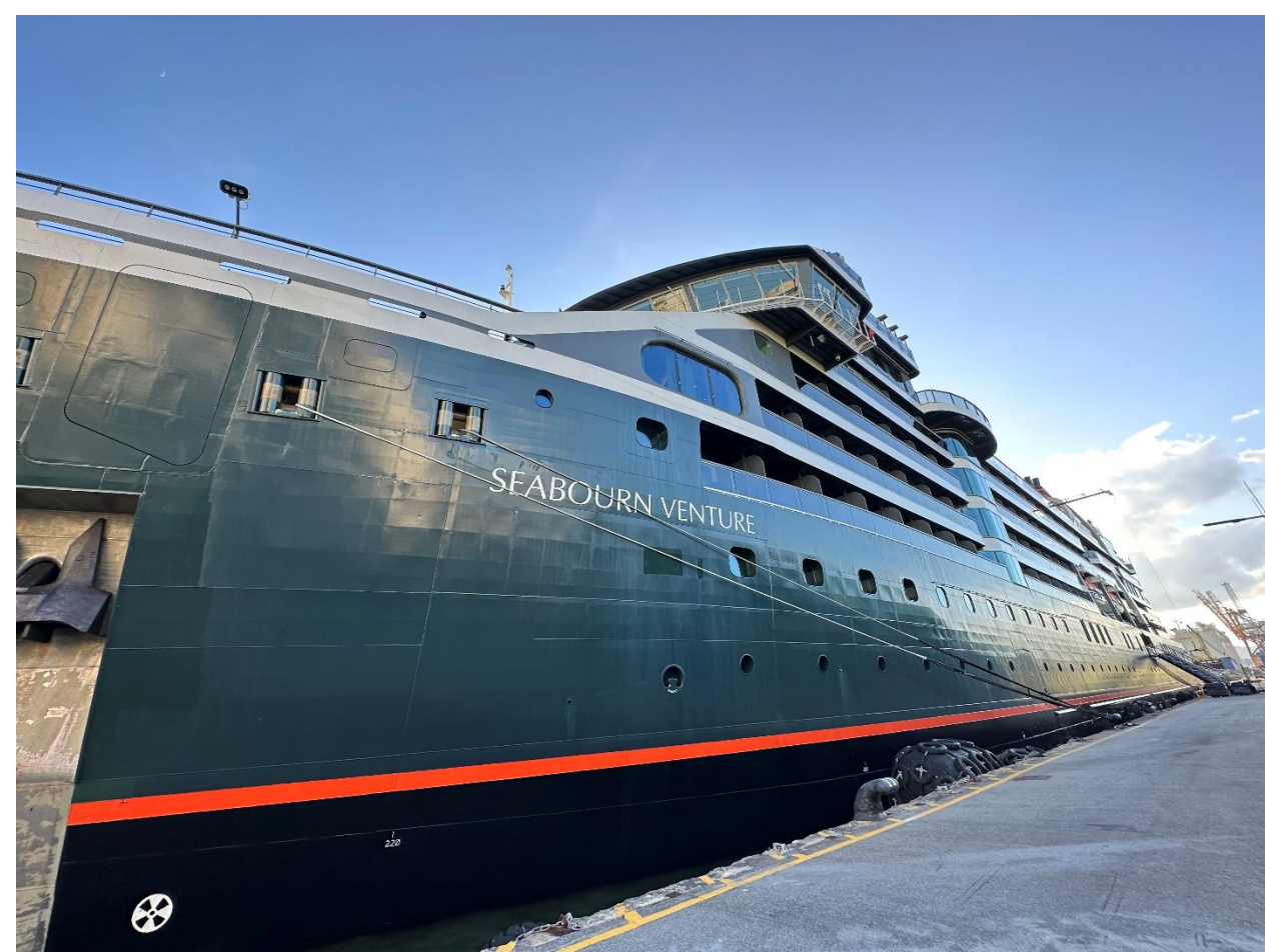
Photo above: The Seabourn Venture of the Seabourn Cruise Line docked at the Port of Port of Spain, Trinidad.