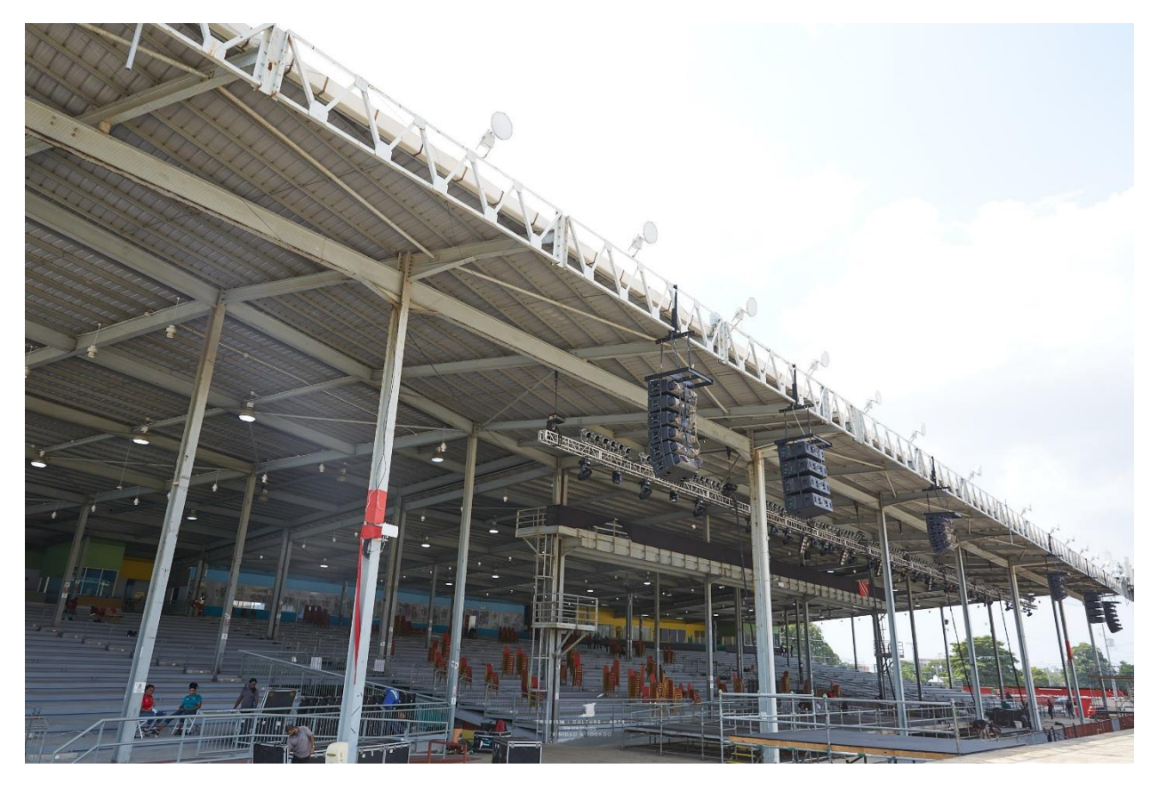
PHOTO 2: Friday January 31st, 2025 – A front side view of the Grand Stand at the Queen's Park Savannah with the recently completed works for Carnival 2025.